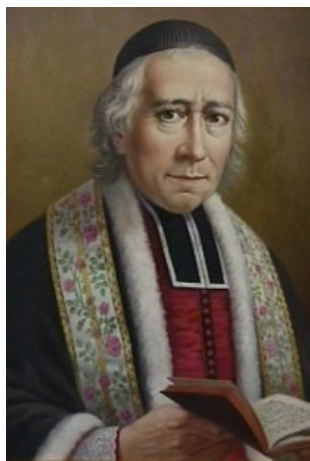
Bl William Joseph Chaminade 1818-1901

Brought up in a large Catholic family, Chaminade was ordained priest in 1785, just before the French Revolution. He refused to take the oath required of priests by the revolution, and had to work secretly. He had to escape to Spain for three years. On return to France